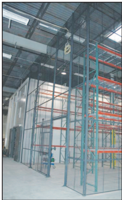
Fig. 1. A WireCrafters cage under construction

“Controlled substances” are those that are regulated by the Drug Enforcement Administration (DEA). While most attention is paid to illegal drugs such as heroin or cocaine, the DEA is also intimately involved with regulating the distribution of legitimate, medically necessary drugs produced by the pharmaceutical industry. Over the years, the DEA has established a system of monitoring the prescribing and dispensing of these drugs; their manufacture; the raw materials for their production; and how the finished products are stored and transported.