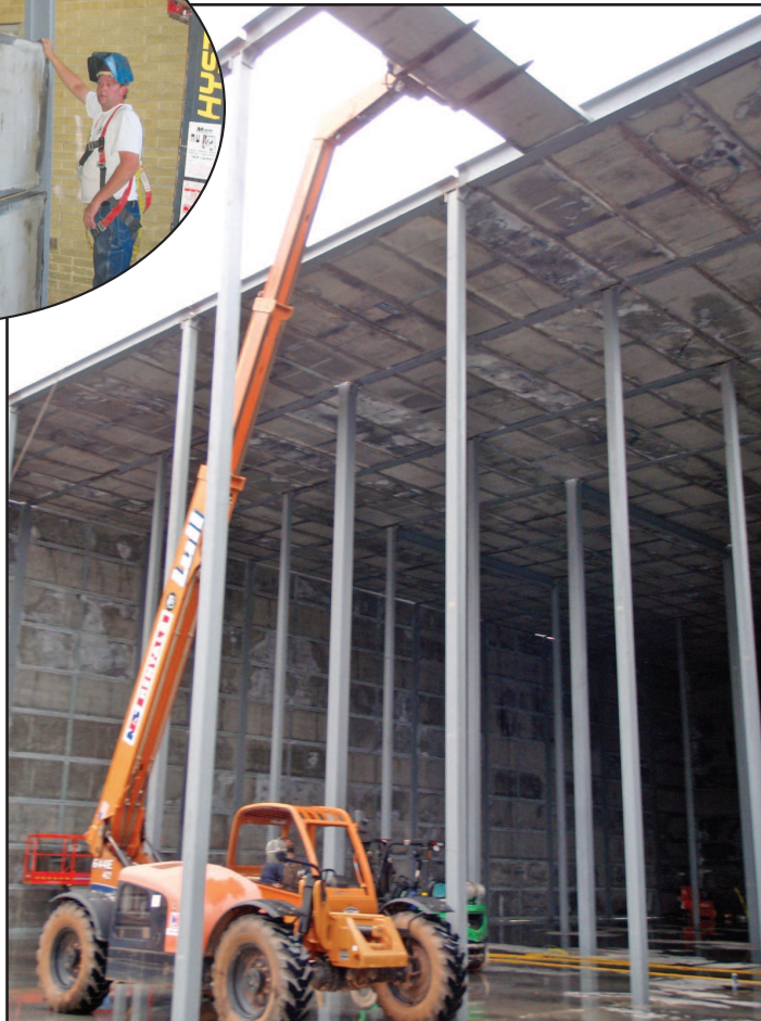
Fig. 2. Custom Vault's panels form both the walls (left) and the roof of a very large pharma vault